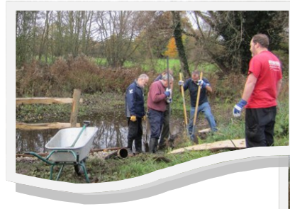
Repairing Fencing at Marsh Bridge

Fortunately it doesn't appear to have materialised yet but we will continue to be vigilant.