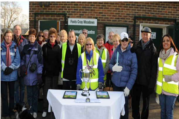
Members with the Trophy before the walk

The Friends of Fots Cray Meadows celebrate success at the Bexley Environmental Challenge awards evening for 2011 held on the 11 th January, We were able to parade the Cup at our Winter Walk on Sunday 15 th January.