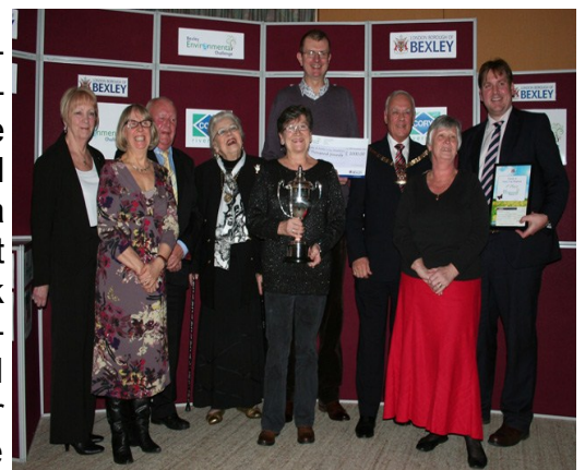
Receiving First Prize