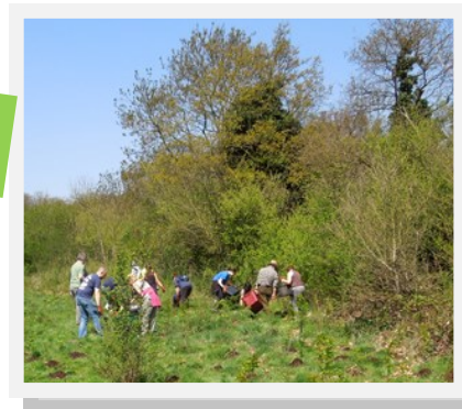
Envision Community Project Tree Mulching