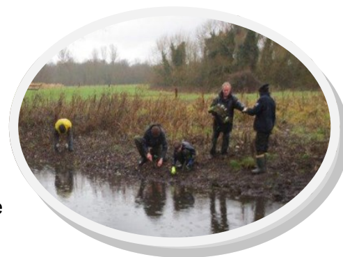
Planting at Marsh Bridge