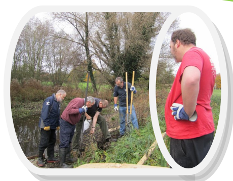
Friends of Foots Cray Meadows and Thames21 volunteers repairing Marsh Bridge